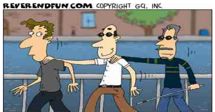
(See Luke 6:39) 10-16-2009 USING A THIRD PARTY, THEY WERE ABLE TO FIND A LOOPHOLE IN THE BLIND LEADING THE BLIND RULE